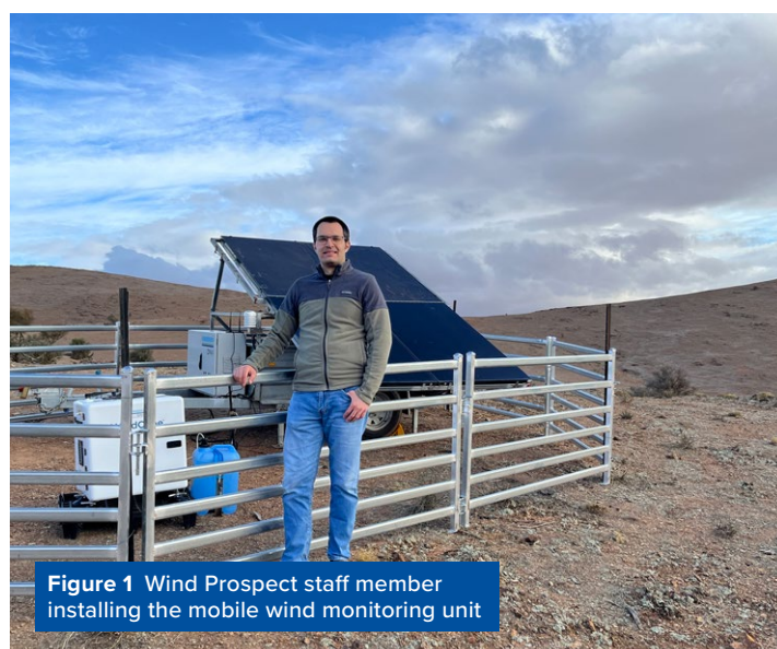
Figure 1 Wind Prospect staff member installing the mobile wind monitoring unit

The project's wind monitoring regime continues, with 18 months of data now having been recorded from the two 130m masts installed in November 2022. The two masts are providing key data on wind speeds and directions that will be used in the selection of wind turbine models and final positioning of turbine locations. The data from these masts is being supported by the recent acquisition of two LiDAR (Light Detection and Ranging) wind monitoring units. These units will support the wind model that is used in the detailed design of the wind farm, and the final investment decision for the project, which would follow the project approvals processes if successful.