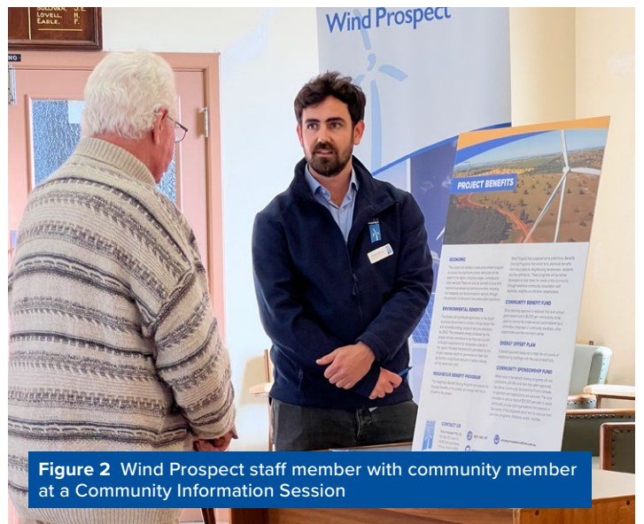
Figure 2 Wind Prospect staff member with community member at a Community Information Session

We will also provide information about how community members can participate in the approvals process and have your say.