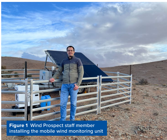
Figure 1 Wind Prospect staff member installing the mobile wind monitoring unit

The project's wind monitoring regime continues, with 18 months of data now having been recorded from the two 130m masts installed in November 2022. The two masts are providing key data on wind speeds and directions that will be used in the selection of wind turbine models and final positioning of turbine locations. The data from these masts is being supported by the recent acquisition of two LiDAR (Light Detection and Ranging) wind monitoring units. These units will support the wind model that is used in the detailed design of the wind farm, and the final investment decision for the project, which would follow the project approvals processes if successful.